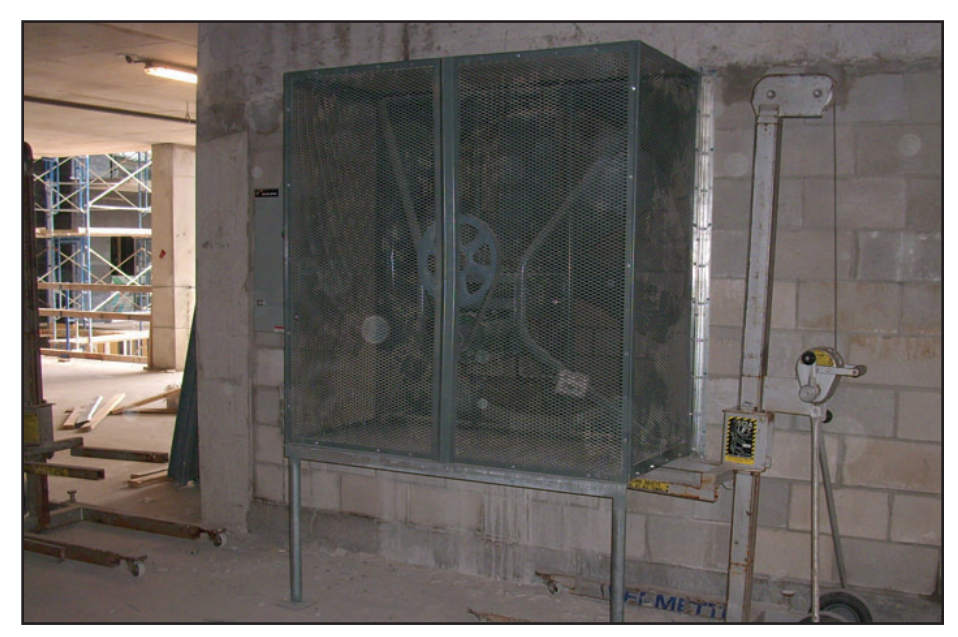
Photo shows an exhaust fan shown in a opening of the air shaft. Six at level one and a total of 40 at the other levels.

Each unit has an integral safety and operating controls with a remote temperature and humidity sensor located on the fourth floor of each tower segment.