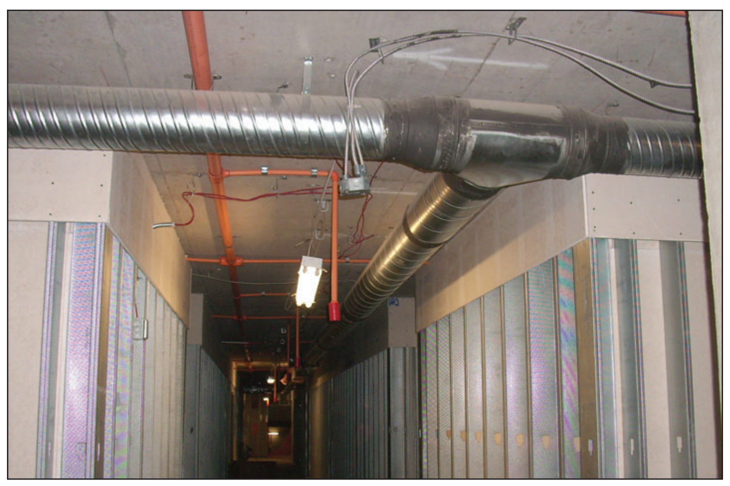
Photo shows make-up air ductwork serving each corridor at each floor, a total of 112 corridors.

conditioning unit with electric heat controlled by a programmable digital thermostat with night setback capability.