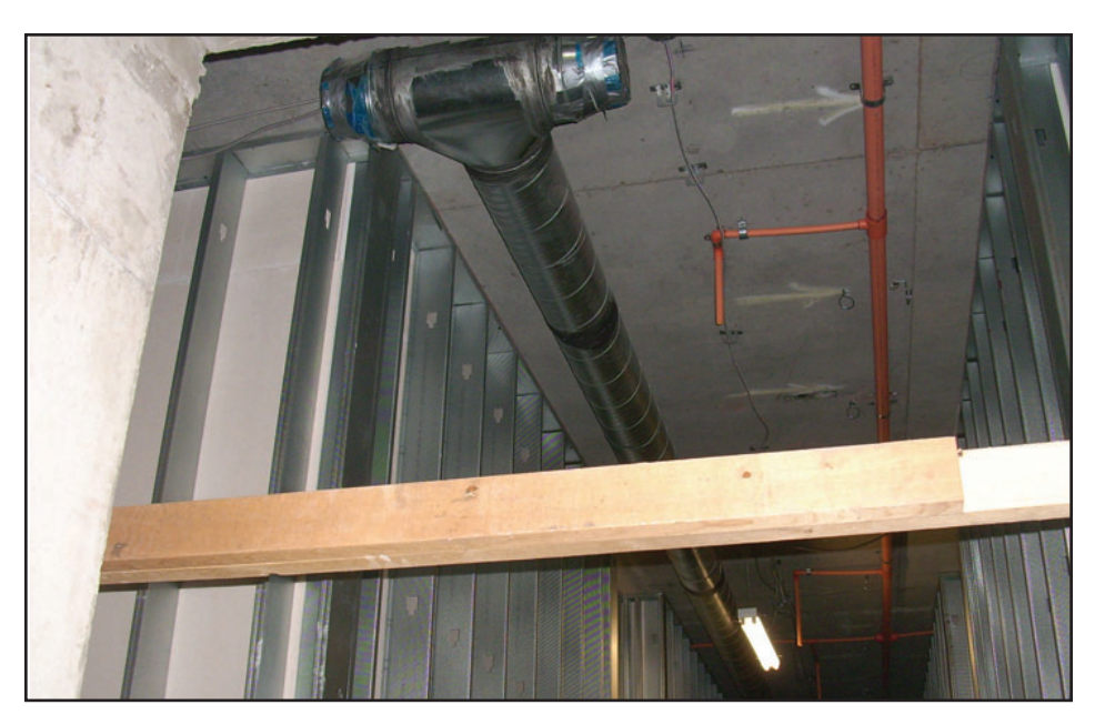
Ductwork in the corridor without the end ductwork installed.

A significant portion of the HVAC work includes the garage ventilation system, equipment or storage spaces requiring ventilation of cooling, and the ground floor lobby, common area, retail space and amenities area that require air conditioning or ventilation.