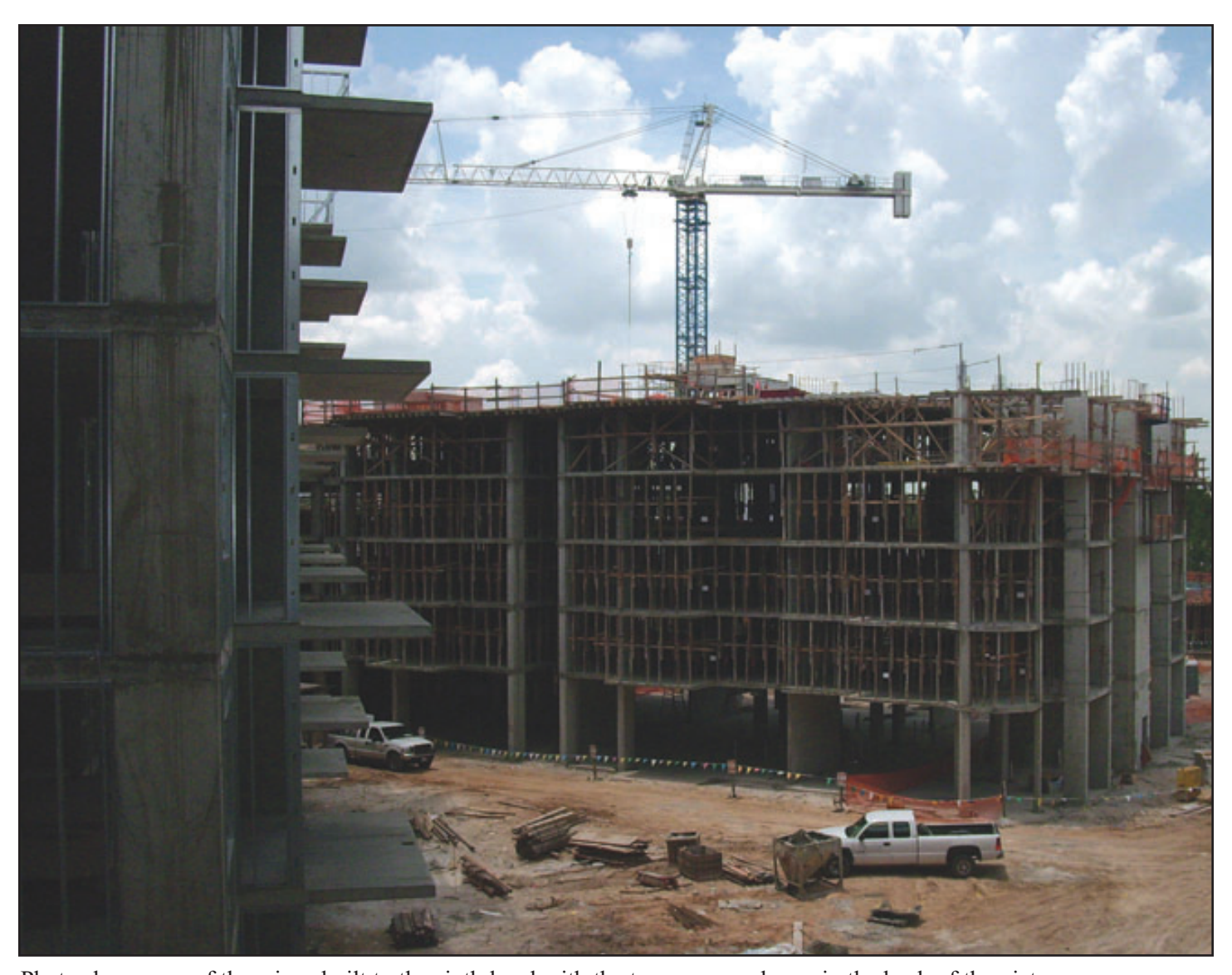
Photo shows one of the wings built to the sixth level with the tower crane shown in the back of the picture.

Architect: Humphreys & Partners Architects, L.P., Maitland, FL