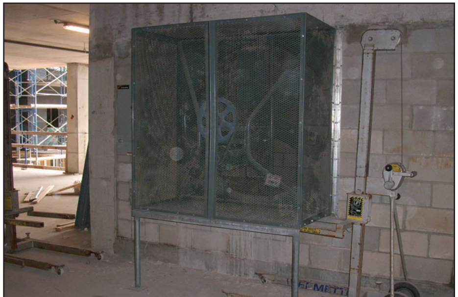
Photo shows an exhaust fan shown in a opening of the air shaft. Six at level one and a total of 40 at the other levels.

Each unit has an integral safety and operating controls with a remote temperature and humidity sensor located on the fourth floor of each tower segment.