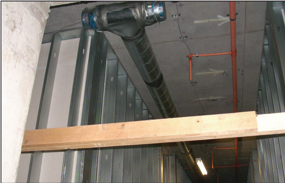
Ductwork in the corridor without the end ductwork installed.

A significant portion of the HVAC work includes the garage ventilation system, equipment or storage spaces requiring ventilation of cooling, and the ground floor lobby, common area, retail space and amenities area that require air conditioning or ventilation.