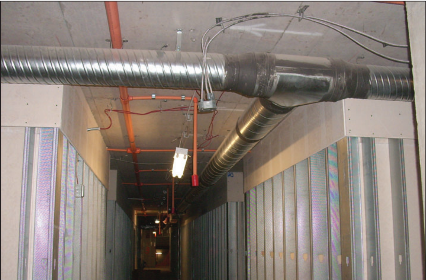
Photo shows make-up air ductwork serving each corridor at each floor, a total of 112 corridors.

conditioning unit with electric heat controlled by a programmable digital thermostat with night setback capability.