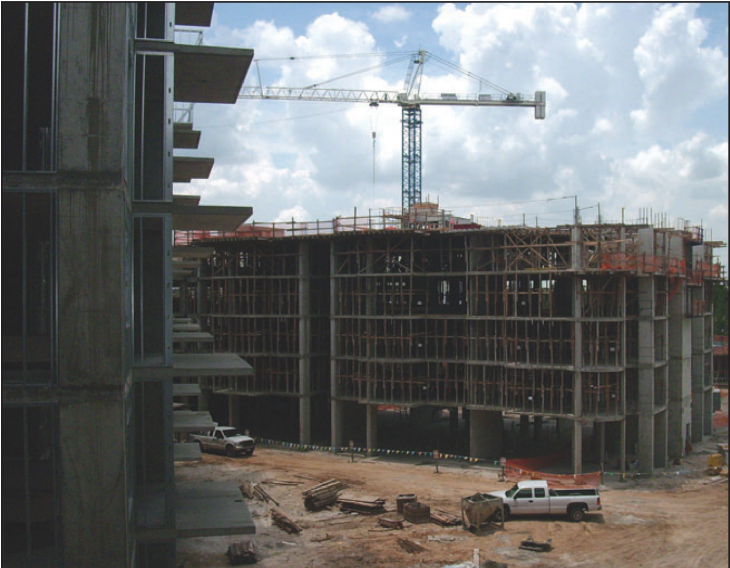
Photo shows one of the wings built to the sixth level with the tower crane shown in the back of the picture.

Architect: Humphreys & Partners Architects, L.P., Maitland, FL General Contractor: Synergy Group, Orlando, FL Mechanical Contractor: Del-Air Heating & Air Conditioning, Sanford, FL Sheet Metal Contractor: McDonald Air & Sheet Metal, Inc., Orlando, FL